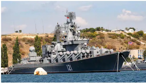
The Russian missile cruiser Moskva anchored in Sevastopol in 2008.

The United States provided Ukraine with intelligence that helped Kyiv identify, attack and sink the flagship of Russia's Black Sea fleet, the Moskva, in one of the most dramatic battlefield successes of the 71-day old war, according to people familiar with the matter.